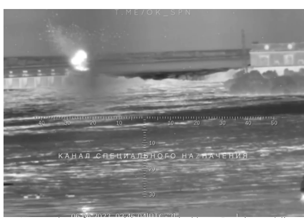
Screenshots from a video recorded by a Russian soldier with a thermal imager.