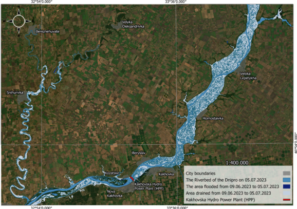
Difference in water mask for the upstream zone (geographical scope of water movement analysis) based on the satellite image from July 5, 2023