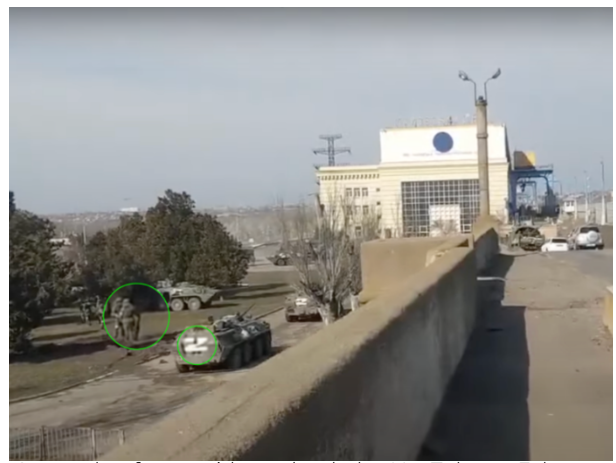
Screenshot from a video uploaded to YouTube on February 24, 2022, showing evidence of Russian troops at the Kakhovka HPP since the first day of the full-scale invasion.

The destruction of the Kakhovka Dam serves as a stark reminder of the war's devastating consequences. It is yet another demonstration of the Russian State policy of inflicting intentional harm on civilian infrastructure, with no consideration for the possibly devastating impact on Ukraine's civilian population. The Dam's explosion caused extensive damage to the environment, and there is no evidence that those behind it took into consideration the reality of the military advantages pursued. This makes the Dam's destruction a clear violation of the principles of international humanitarian law.