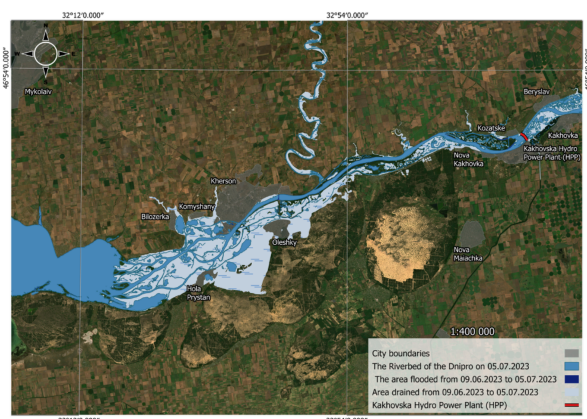
Difference in water mask for the downstream zone (geographical scope of water movement analysis) based on the satellite image from July 5, 2023