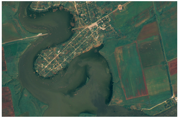
Flooding in Tiahynka on the right bank of Kherson Oblast (location 7), Geosat image from June 6, 2023, resolution 0 75 m

In addition, the analysis commissioned by Greenpeace Central and Eastern Europe (Greenpeace CEE) and included in the report highlights how the destruction of the Dam and the consequent drainage of the Reservoir increased safety risks at the Zaporizhzhia Nuclear Power Plant (ZNPP). Greenpeace CEE also strongly condemns Rosatom, Russia's nuclear energy company, and the Russian government for their plans to restart ZNPP reactors.