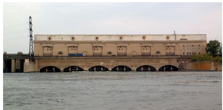
Powerhouse of the Kakhovka Hydroelectric Power Plant.

The report investigates the destruction of the Kakhovka Dam in Ukraine on June 6, 2023. This unleashed a deluge that left widespread flooding and damage in its wake, both downstream and upstream. We conclude there is at least a reasonable basis to believe that the explosion was caused by the Russian Armed Forces. Evidence, including seismic data, eyewitness accounts, and satellite imagery, strongly supports the controlled explosion scenario that implicates Russia. The presence of Russian troops, prior Dam mining, and strategic water level elevation just before the Dam's destruction further corroborate this conclusion. The report attributes the Dam's immediate destruction to the 205th Separate Motor Rifle Brigade of the Russian Armed Forces. This Brigade did not act alone; we outline Russia's military chain of command and note the near-certain involvement of higher-ranking Russian officials.