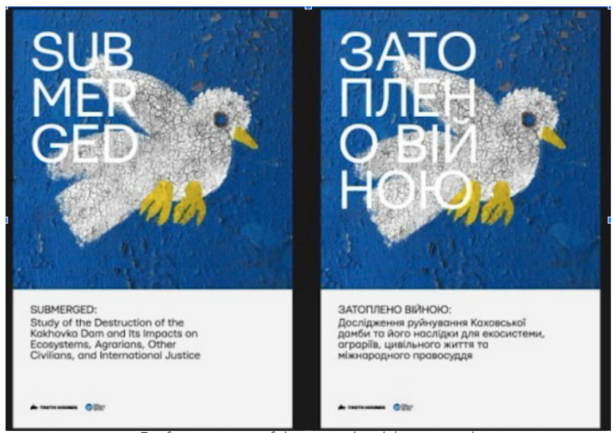
Draft cover page of the report (work in progress)

A Comprehensive Report by Truth Hounds and Project Expedite Justice